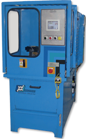
Shown with opti-touch cycle start option