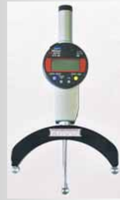
Tauring ARC 50-130 Digital Radius Gauge