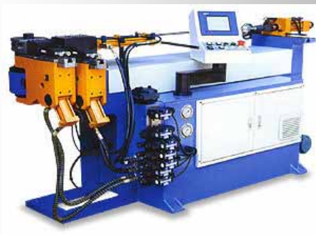
YLM NC38 TSQ Mandrel Bender