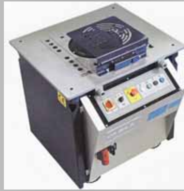
Ofmer P42 Reo Bar Bender