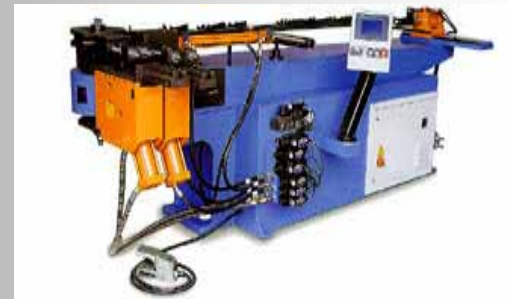
YLM NC50 TSQ Mandrel Bender