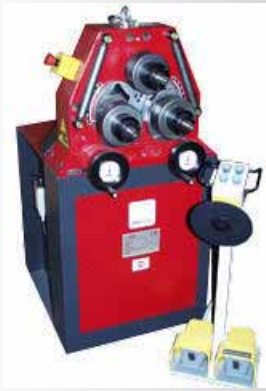
Tauring Alfa 40H2 Ring Roller