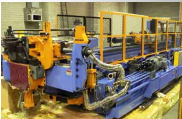
YLM CNC80 fully Automatic Tube Bending and rolling machine